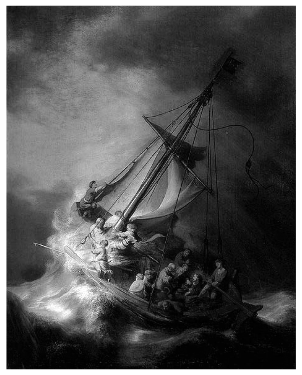
FIGURE 3. The Boat That Held Jesus and His Followers Before Jesus Bid the Storm to Subside (Mark 4:38-40)

Storm on the Sea of Galilee By Rembrandt van Rijn (1633; whereabouts unknown since the Isabella Stewart Gardner Museum robbery in 1990)