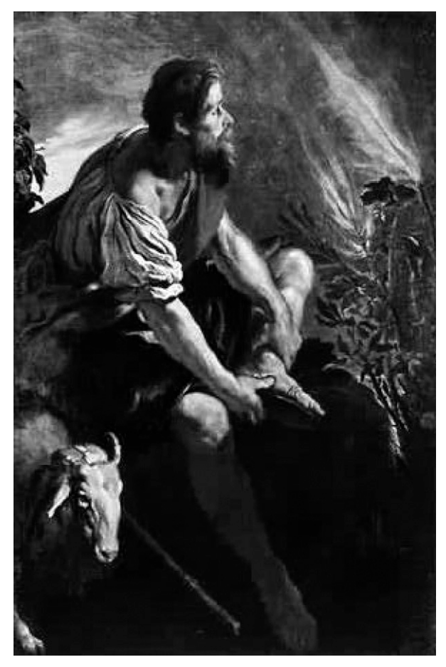
Moses Before The Burning Bush (1613–14) By Domenico Feti, at Kunsthistorisches Museum, Vienna, Austria

in functioning before the onset of psychosis. A prodrome refers to the early symptoms and signs of an illness that precede the characteristic manifestations of the acute, fully developed illness. A prodromal period may precede the onset of schizophrenia by months to up to 10 years in 70% of patients<sup>33</sup> and up to 20 years in some cases.<sup>34</sup> The period over which Moses had these experiences was in excess of 40 years, fulfilling Criterion C. His social functioning and leadership skills were sufficiently intact to have made it less likely that he had periods of debilitating major depression or florid mania that might have undermined his effectiveness as a leader. This could fulfill Criterion D by reducing the likelihood of mood disorder-associated psychosis. It should be noted that the religious writings attributed to Moses'